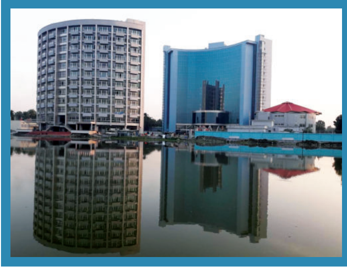
শেখ হাসিনা সফটওয়্যার টেকনোলজি পার্ক, যশোর

হাইটেক পার্ক আইটি সংক্রান্ত সকল সামগ্রী তৈরি, আমদানি ও রপ্তানি করার সব ধরনের সুবিধা সম্বলিত প্রযুক্তিভিত্তিক শিল্পায়ন। বঙ্গবন্ধু হাইটেক সিটি, শেখ হাসিনা সফটওয়্যার টেকনোলজি পার্ক, জনতা টাওয়ার টেকনোলজি পার্কসহ সারাদেশে বিভিন্ন জেলায় আরও হাইটেক পার্ক নির্মাণাধীন রয়েছে। তরুণদের কর্মসংস্থান এবং হার্ডওয়্যার ও সফটওয়্যার শিল্পের উত্তরণ ও বিকাশই হাইটেক পার্ক স্থাপনের উদ্দেশ্য। দেশ-বিদেশের নামকরা শিল্পপ্রতিষ্ঠানগুলো এসব পার্কে তাদের কারখানা প্রতিষ্ঠা করবে। দেশের তরুণরা এসব কারখানায় কাজ করার ও শেখার সুযোগ পাবে। ফলে তারা প্রয়োজনীয় প্রশিক্ষণ এবং গবেষণা করে নতুন নতুন শিল্প গড়ে তুলতে পারবে।