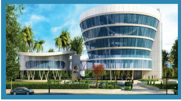
বঙ্গবন্ধু হাইটেক সিটি, কালিয়াকৈর